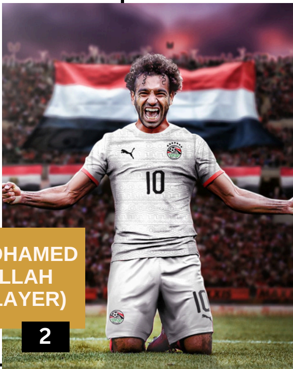
MOHAMED SALLAH (PLAYER)

Salah is the leading scorer in the English Premier League thus far, and is looking like leading his club to another league title. His nomination is a testament to his consistency and respect he has earned in the football world.