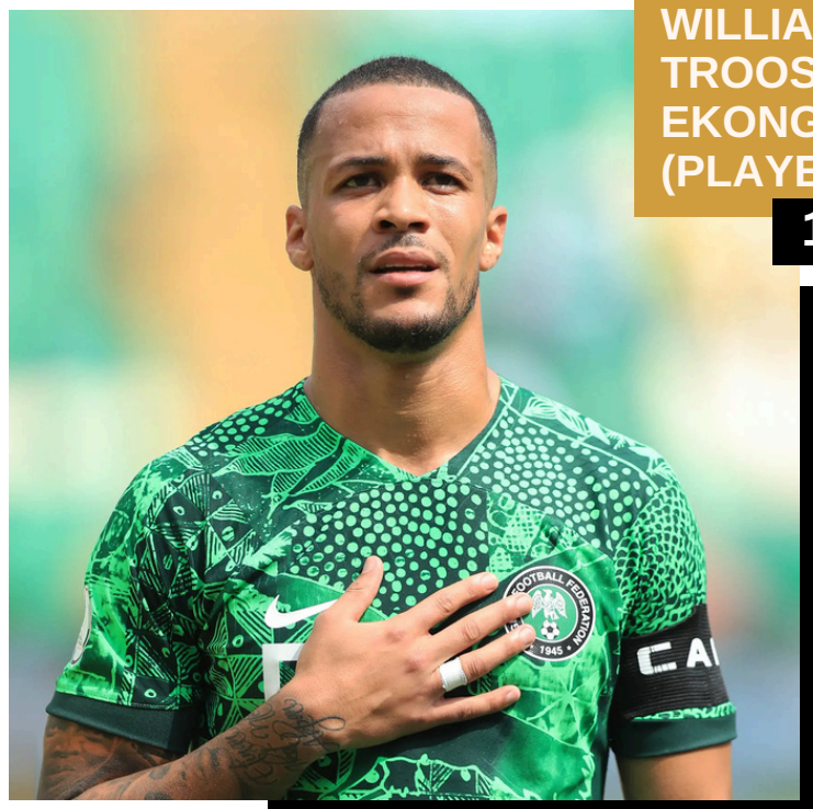
WILLIAM TROOST- EKONG (PLAYER)

As captain of the Nigerian team, he was pivotal to his team reaching the final of the Africa Cup of Nations, scoring 3 goals in the tournament, a remarkable feat for a defender in AFCON history. He was also named Player of the Tournament and this marked the start of a remarkable 2024 for him.